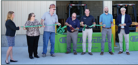
Bates Recycling celebrates the completion of its RLG Special Accounts project.