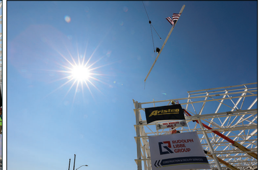
It is a tradition for all those who contributed to the project to sign the final beam.

Sheffield, Ohio — More than 500 trades workers, project team members, engineers, architects, plant operations and leadership, and support personnel were on hand to watch as a crane lifted the final steel beam for the 2.7 million-square-foot Ford Motor Co. Ohio Assembly Plant project into place. Rudolph Libbe is building the expansion at the plant, which will begin producing an all-new electronic commercial vehicle mid-decade. A small pine tree and American flag placed on the beam before it was hoisted stems from an ancient Scandinavian tradition that has transformed into a symbol of growth, success and most importantly that the project is being completed safely.