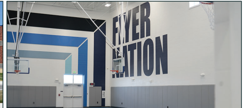
Left: Lake Local Schools officials cut the ribbon on their new elementary school. Center: The exterior of the school's entrance. Right: The gymnasium is part of a multi-function area called the 'Cafenasium.'

Millbury, Ohio — It was fitting that it was oppressively hot on the day Lake Local Schools showed off its new elementary school to the community.