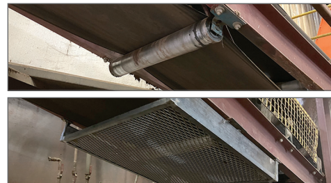
GEM associates fabricated hundreds of sections of guarding to protect workers.