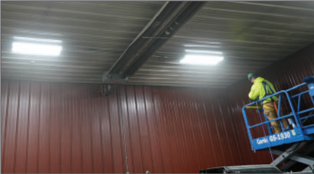
New LED lighting brightens up the work area. The worker sprayed down the walls after scrubbing to remove years of diesel soot that had built up.