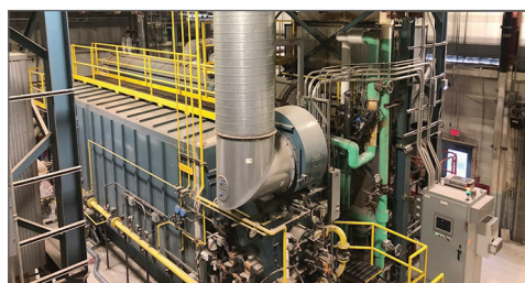
St. Vincent's staff needed safe access to construction zones to read gauges and manage the facility.

The combined RLI/GEM team finished the upgrades within three weeks and received a grateful “Thank You” from the customer.