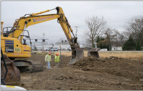
RLI laborers backfill pipe during construction of the Rolled Alloys facility in Monclova Township. The project is expected to be completed in August 2024.